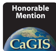
Emblems to Place on Your Maps!

The Submission Process is Now Done Online!